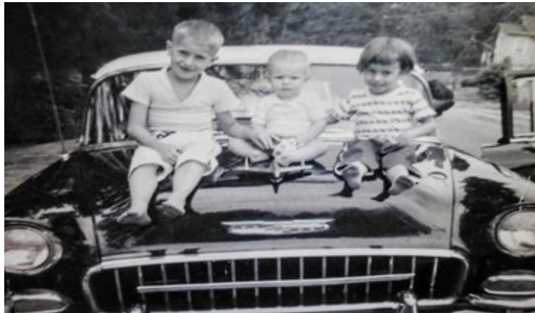
The cute one in the middle is me on the hood of my Dads

I loved going for a ride in my Dad's '55 Chevrolet Del-Ray Coupe. It sounded so good with dual, exhaust, Smitty Glass Pack mufflers exited out the rear of the Chevy's bumper. Man those rumbling exhaust notes sounded so good! Needless to say, I was absolutely addicted to the sounds any engine was capable of making. From those days forward I always dreamed of owning a '55 Chevrolet Bel-Air like my dad's.